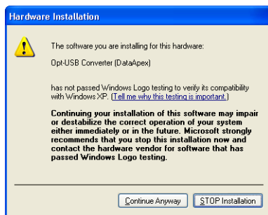
Fig. 2: Windows Logo Testing Message