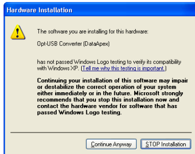
Fig. 3: Windows Logo Testing Message