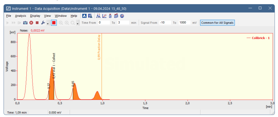
Fig. 10: Data Acquisition window

The Data Acquisition window can display the fractions in the graph using the background color and also the start and stop fraction events and marker of the Fraction Delay. To see the fractions and markers right click on the graph, select Properties... to open the Graph Properties dialog and check the Show Events checkbox.