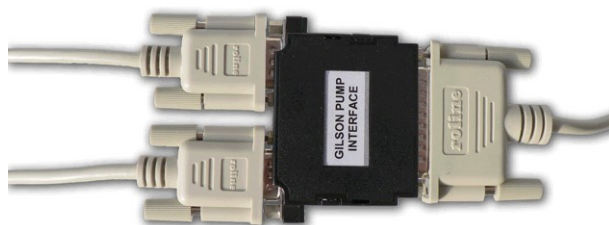
IGLN1 Converter RS232/GSIOC for Gilson

Additional pumps or other devices can be connected to the converter by using the IGLN2 adaptor cable (each additional device might require an additional adaptor cable, depending on the distance between particular pumps. No additional cables are usually necessary). Please note: The GSIOC driver must be installed properly on your PC. The installation program is on the Clarity installation CD.