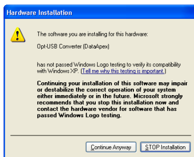
Fig 2: Windows Logo Testing Message