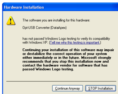
Fig 3: Windows Logo Testing Message